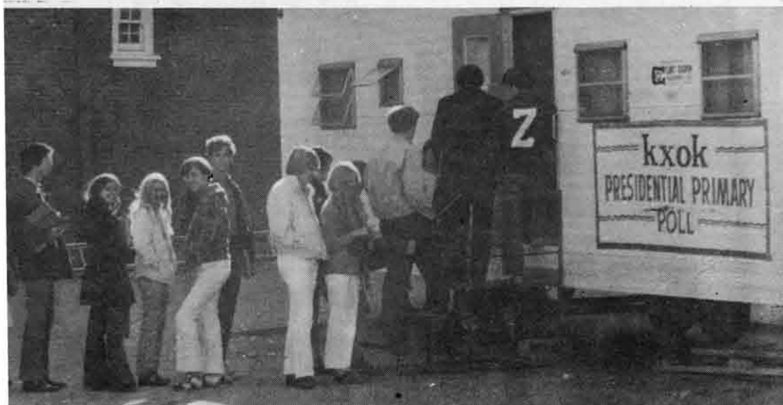
The KXOK presidential primary poll, conducted on campus last Friday, was also a means of registering voters.