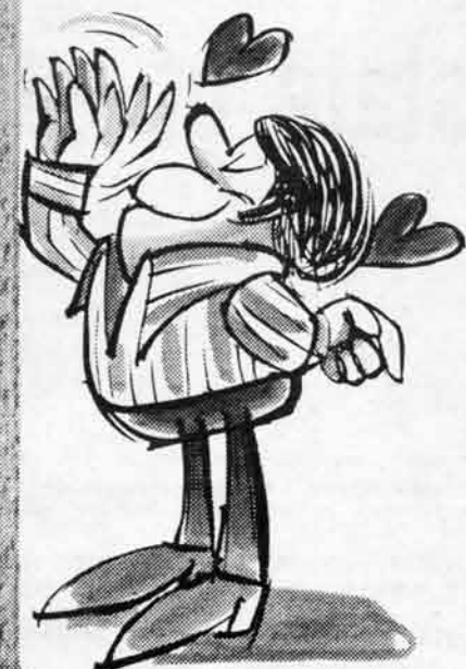
© 1971 CARLING BREWING COMPANY, BELLEVILLE, ILLINOIS