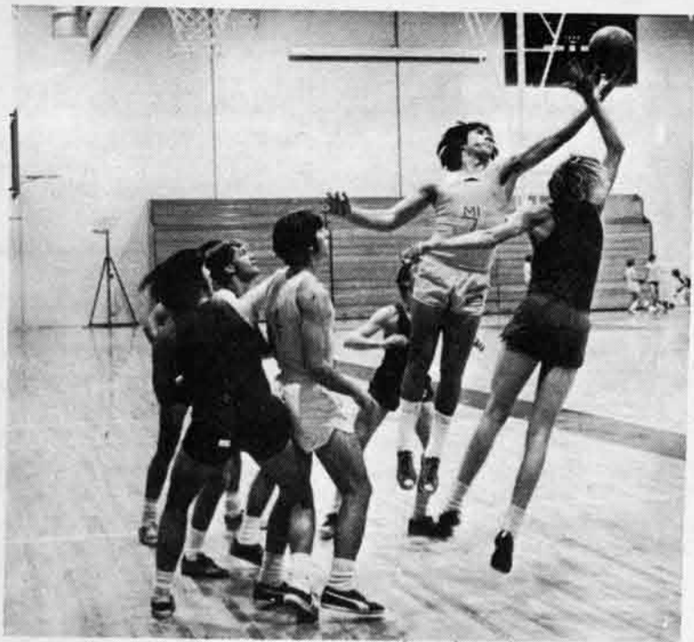
What, no snow? For the first time in UMsl history intramural basketball competition is taking place on schedule, regardless of the elements. Herewith an example of this season's bone jarring action.